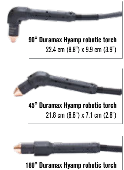
20.8 cm (8.15")x 3.5 cm (1.375")