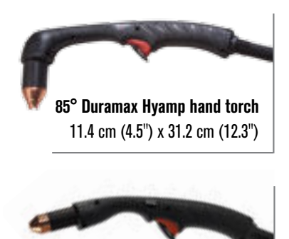
15° Duramax Hyamp hand torch 6.8 cm (2.68") x 29.5 cm (11.6")

Compatible with Powermax65, 85, 105 and 125 systems.