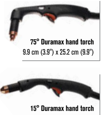
6.6 cm (2.6") x 25.9 cm (10.2")

Compatible with Powermax65<sup>®</sup>, 85 and 105 systems.