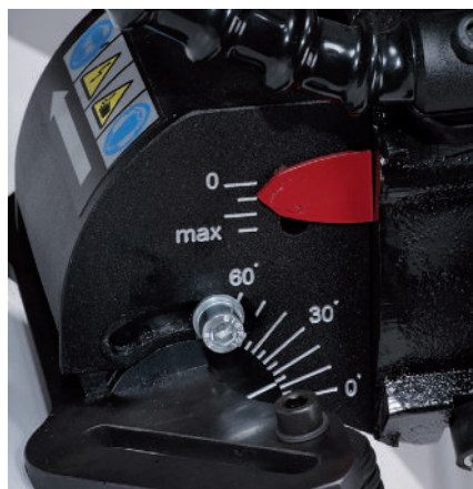
Continuous angle adjustment from 0 to 60 degrees.