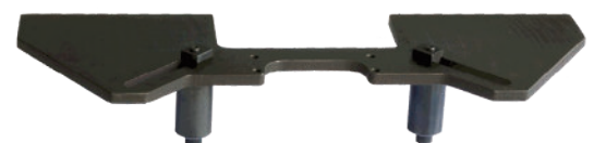
Optional guide for pipes Ø 260-600mm (10-24") Product code: PRW-0461-22-00-00-0