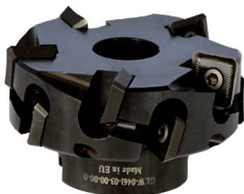
Mono block milling head, with 10 indexable inserts fixed with screws. Product code: GLW-0461-03-00-00-0