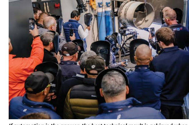
If automation is the answer, the best technical result is achieved when combining the best welding equipment and the best consumables with a suitable manipulation system