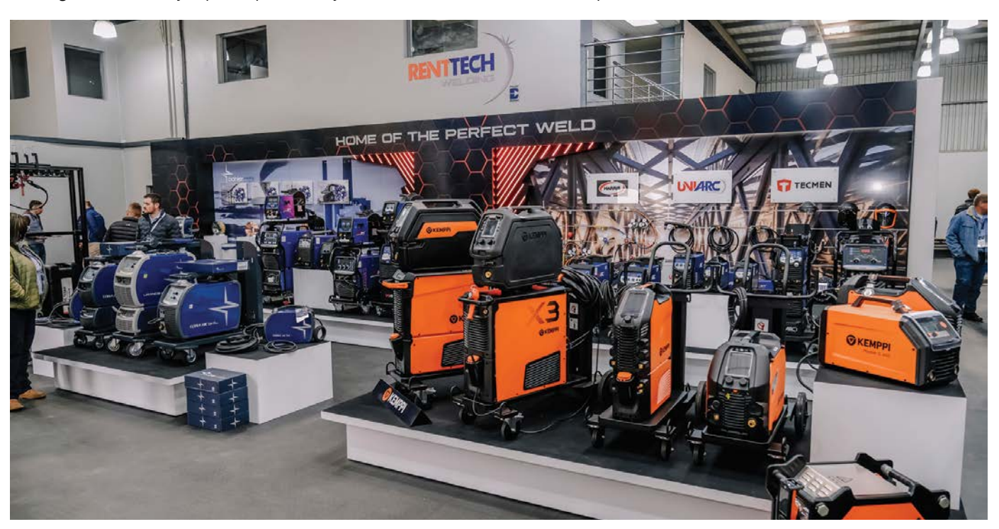
Renttech Welding's new ATC is a hands-on solutions development, demonstration and customer focused facility to highlight the benefits of its premium brands.