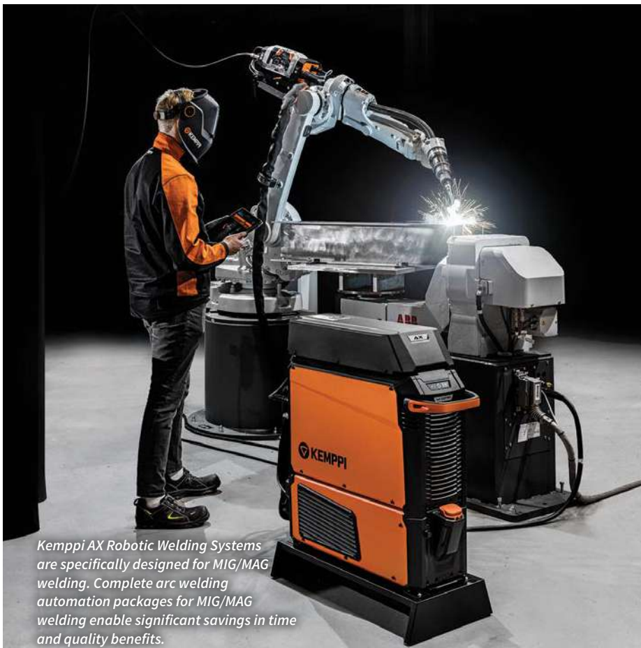
Kemppi AX Robotic Welding Systems are specifically designed for MIG/MAG welding. Complete arc welding automation packages for MIG/MAG welding enable significant savings in time and quality benefits.