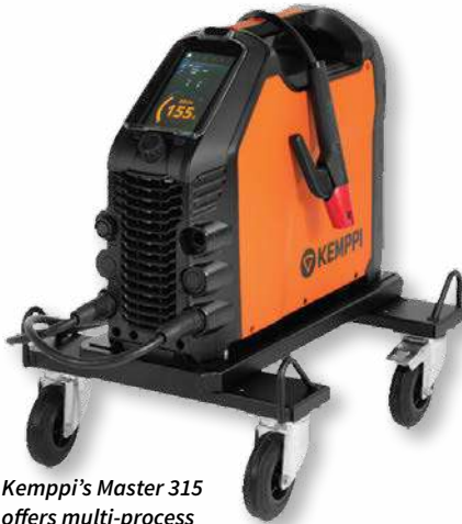
Kemppi's Master 315 offers multi-process welding from cellulosic MMA to pulsed SMAW, all from a new user interface, which has been carefully put together with welders in mind.

for even complex arc welding processes such as pulsed MIG/MAG welding have been made particularly easy. "If using the Kemppi Master M 358 for pulsed MAG welding, for example, Weld Assist asks the welder to choose the base material being welded, the gas being used, the wire thickness, the welding position, and the travel direction. The software comes back with all the machine parameter options, which can then be selected for use or adjusted if necessary. This takes the guesswork out of setting up a welding machine prior to welding," he explains.