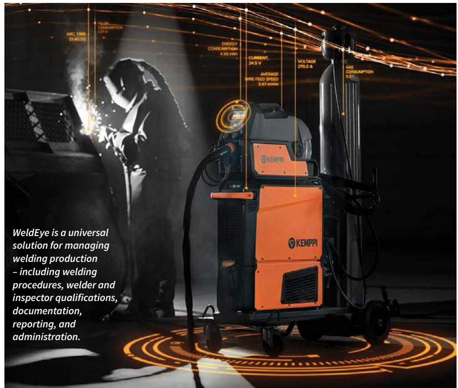
WeldEye is a universal solution for managing welding production – including welding procedures, welder and inspector qualifications, documentation, reporting, and administration.

WisePenetration is another innovation unique to Kemppi. "Normally in CV MIG/MAG welding, the power to the weld pool will change when the welder changes the stand-off distance between the joint and